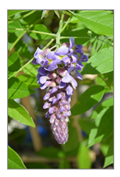
Amethyst Falls Wisteria flower buds Photo courtesy of NetPS Plant Finder

Amethyst Falls Wisteria flowers Photo courtesy of NetPS Plant Finder