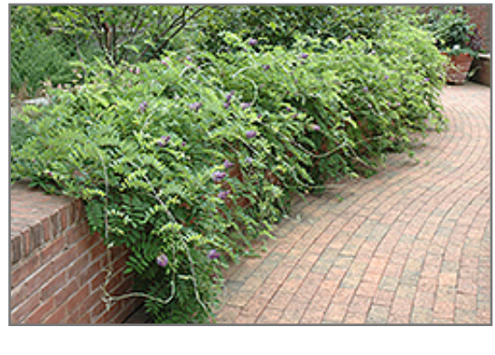
Amethyst Falls Wisteria in bloom

Amethyst Falls Wisteria is recommended for the following landscape applications;