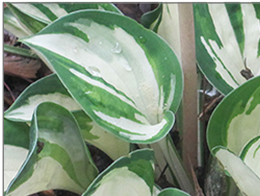
Pandora's Box Hosta foliage