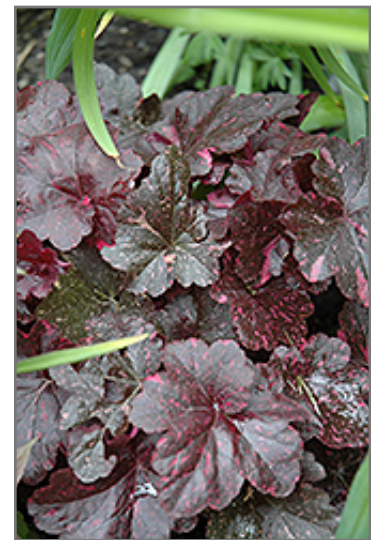
Midnight Rose Coral Bells foliage