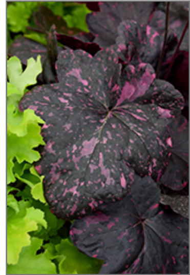
Midnight Rose Coral Bells foliage

Midnight Rose Coral Bells is recommended for the following landscape applications;