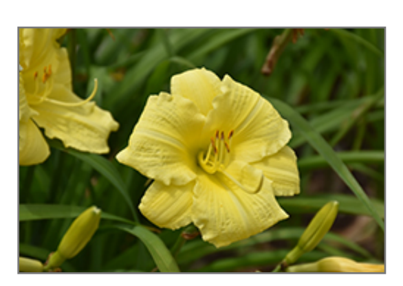
Rainbow Rhythm Going Bananas Daylily flowers