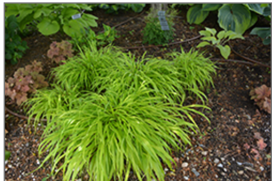
All Gold Hakone Grass