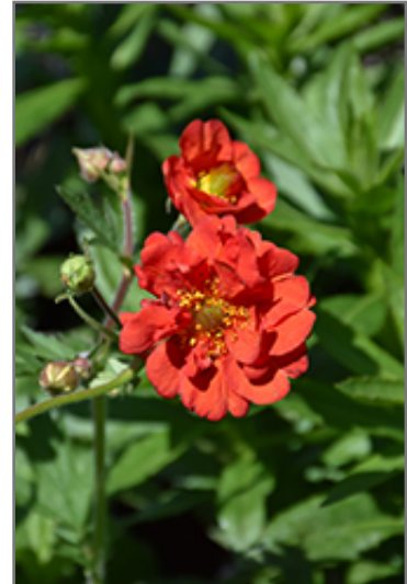
Blazing Sunset Avens flowers

Blazing Sunset Avens is recommended for the following landscape applications;