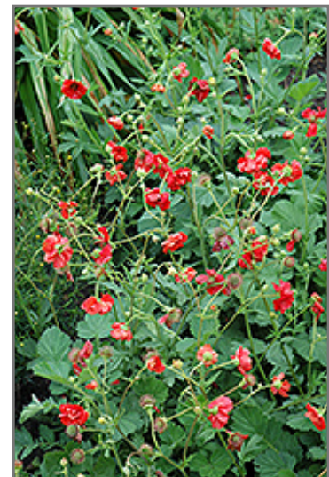
Blazing Sunset Avens in bloom