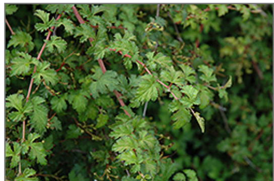
Cutleaf Stephanandra foliage