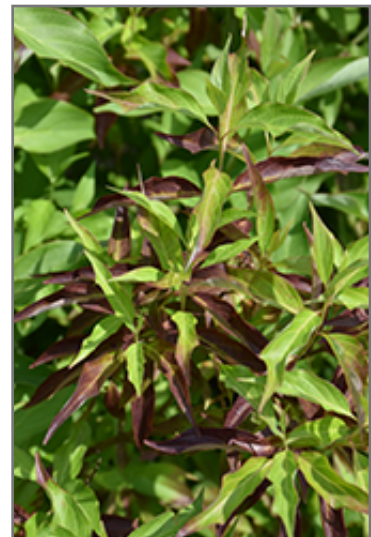
Red Gnome Dogwood foliage