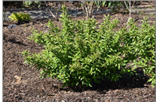
Red Gnome Dogwood