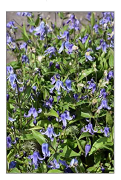
Solitary Clematis flowers