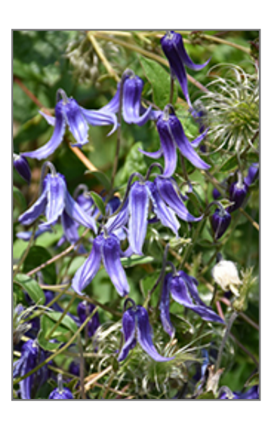
Solitary Clematis flowers