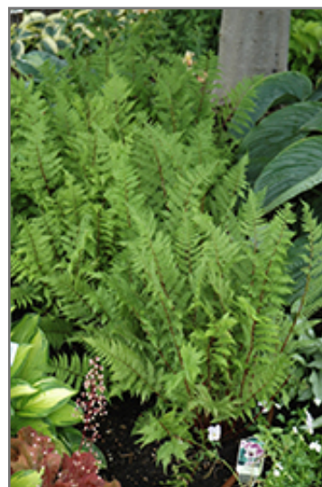
Lady in Red Fern