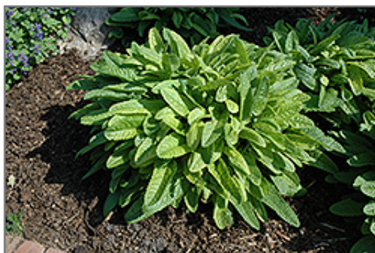
Hummelo Betony