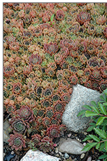
Silverine Hens And Chicks