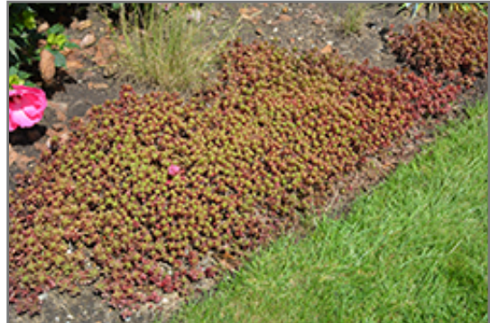
Fulda Glow Stonecrop