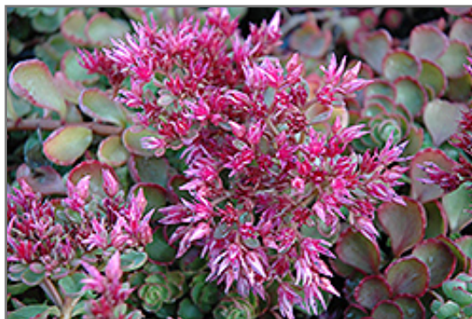
Fulda Glow Stonecrop flowers