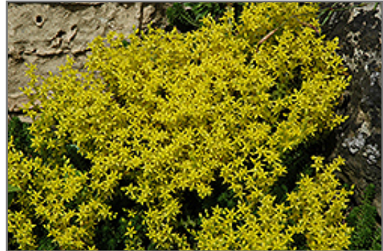
Golden Moss Stonecrop flowers