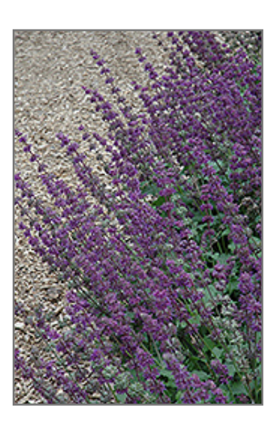
Purple Rain Salvia in bloom

An erect perennial variety featuring arched, whorled spikes of two-lipped violet-purple flowers throughout summer; tolerates drought once established; best in poorer soils; deadhead to extend flowering; perfect for borders, rock gardens, or naturalizing