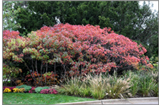
Prairie Flame Shining Sumac in fall

This shrub does best in full sun to partial shade. It is very adaptable to both dry and moist growing conditions, but will not tolerate any standing water. It is not particular as to soil type or pH. It is highly tolerant of urban pollution and will even thrive in inner city environments. This is a selection of a native North American species.