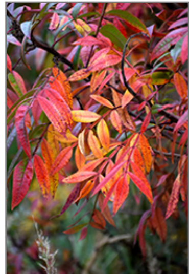
Prairie Flame Shining Sumac in fall

This is a high maintenance shrub that will require regular care and upkeep, and is best pruned in late winter once the threat of extreme cold has passed. It is a good choice for attracting butterflies to your yard. Gardeners should be aware of the following characteristic(s) that may warrant special consideration;