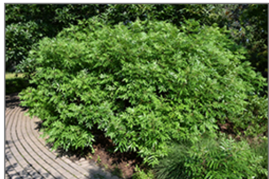
Prairie Flame Shining Sumac