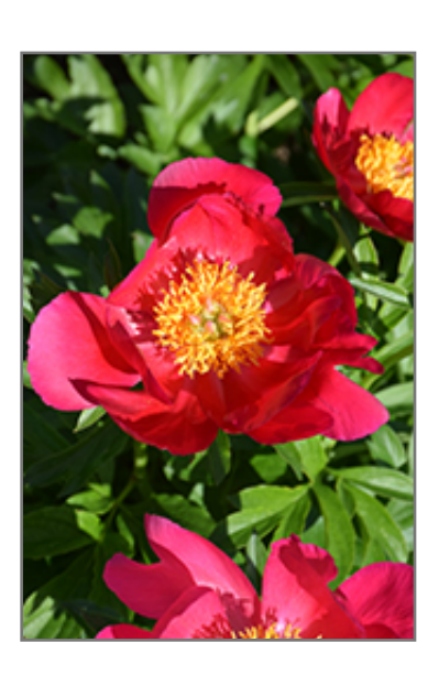
Scarlet O'Hara Peony flowers

Scarlet O'Hara Peony will grow to be about 30 inches tall at maturity, with a spread of 3 feet. When grown in masses or used as a bedding plant, individual plants should be spaced approximately 30 inches apart. The flower stalks can be weak and so it may require staking in exposed sites or excessively rich soils. It grows at a slow rate, and under ideal conditions can be expected to live for approximately 20 years. As an herbaceous perennial, this plant will usually die back to the crown each winter, and will regrow from the base each spring. Be careful not to disturb the crown in late winter when it may not be readily seen!