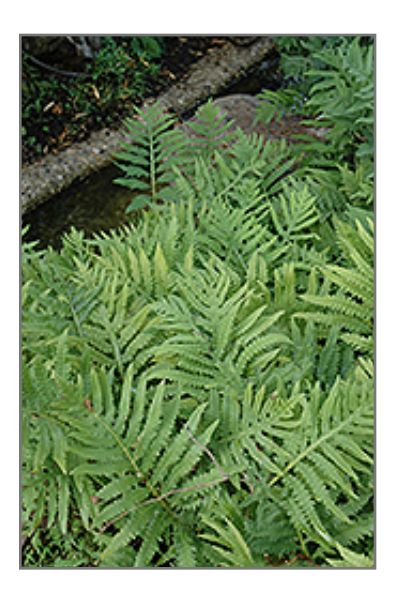
Sensitive Fern foliage