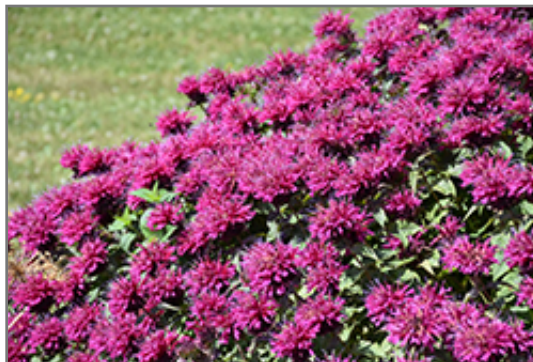
Grand Marshall Beebalm flowers