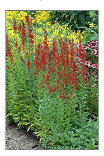
Cardinal Flower in bloom