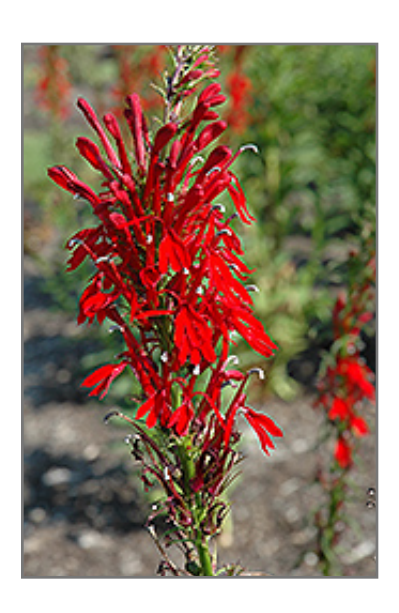
Cardinal Flower flowers