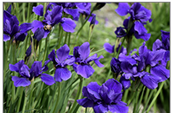
Caesar's Brother Siberian Iris flowers