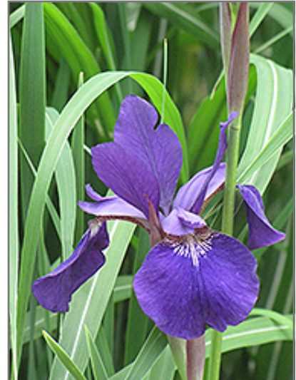
Caesar's Brother Siberian Iris flowers