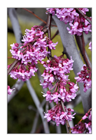
Lavender Twist Redbud flowers