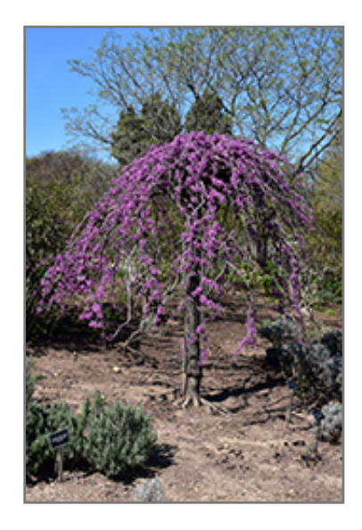
Lavender Twist Redbud in bloom

Lavender Twist Redbud is a multi-stemmed deciduous shrub with a rounded form and gracefully weeping branches. Its average texture blends into the landscape, but can be balanced by one or two finer or coarser trees or shrubs for an effective composition.