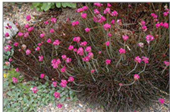
Red-leaved Sea Thrift in bloom