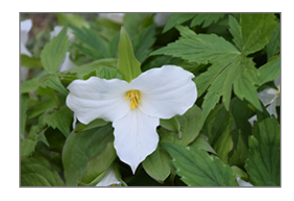
Great White Trillium flowers