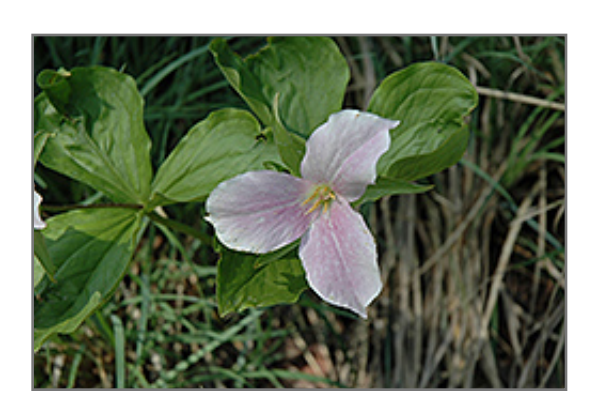
Great White Trillium flowers (faded)

Great White Trillium will grow to be about 8 inches tall at maturity extending to 12 inches tall with the flowers, with a spread of 12 inches. When grown in masses or used as a bedding plant, individual plants should be spaced approximately 10 inches apart. Its foliage tends to remain low and dense right to the ground. It grows at a slow rate, and under ideal conditions can be expected to live for approximately 10 years. As an herbaceous perennial, this plant will usually die back to the crown each winter, and will regrow from the base each spring. Be careful not to disturb the crown in late winter when it may not be readily seen! As this plant tends to go dormant in summer, it is best interplanted with late-season bloomers to hide the dying foliage.