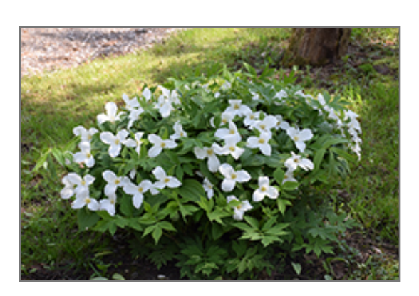
Great White Trillium in bloom