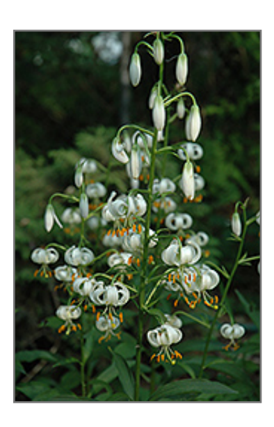
White Martagon Lily flowers

White Martagon Lily features bold nodding dark red trumpet-shaped flowers with red overtones at the ends of the stems in early summer. The flowers are excellent for cutting. Its narrow leaves remain green in color throughout the season.