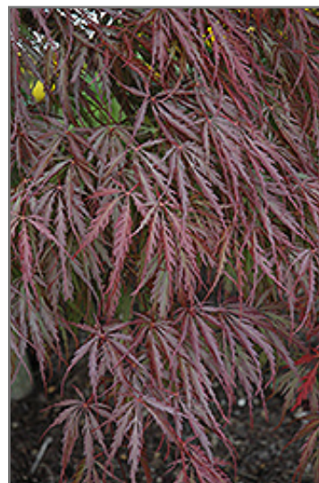
Tamukeyama Japanese Maple foliage