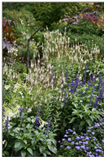
Culver's Root in bloom