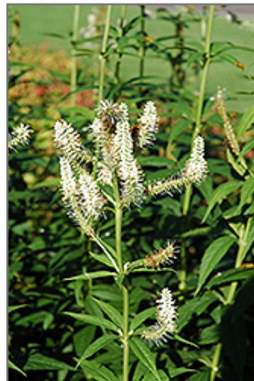
Culver's Root flowers