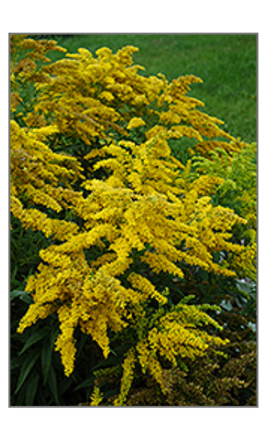
Crown Of Rays Goldenrod flowers