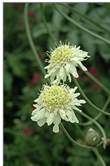
Giant Yellow Scabious flowers