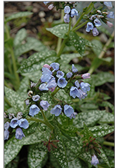
Roy Davidson Lungwort flowers