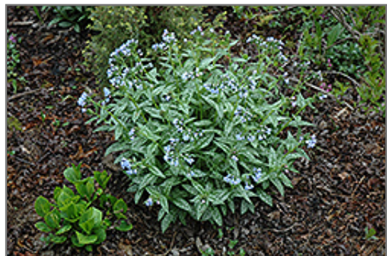
Roy Davidson Lungwort in bloom