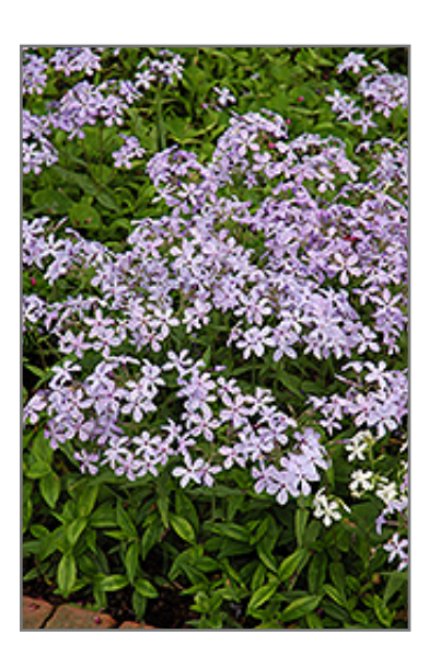
Woodland Phlox flowers