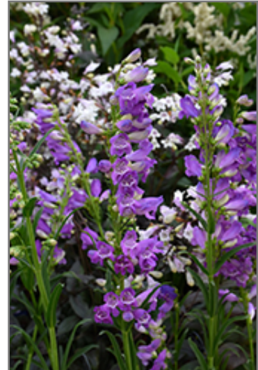
Prairie Dusk Beard Tongue flowers