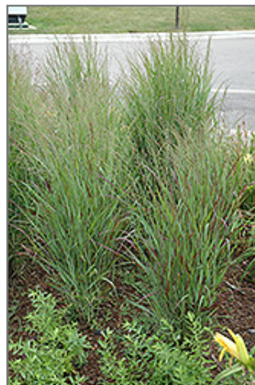
Shenandoah Reed Switch Grass