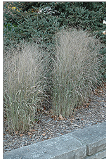
Shenandoah Reed Switch Grass in fall

This plant does best in full sun to partial shade. It is very adaptable to both dry and moist locations, and should do just fine under typical garden conditions. It is considered to be drought-tolerant, and thus makes an ideal choice for a low-water garden or xeriscape application. It is not particular as to soil type, but has a definite preference for alkaline soils, and is able to handle environmental salt. It is somewhat tolerant of urban pollution. This is a selection of a native North American species. It can be propagated by division; however, as a cultivated variety, be aware that it may be subject to certain restrictions or prohibitions on propagation.