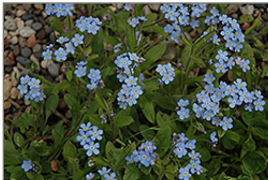
Forget-Me-Not flowers