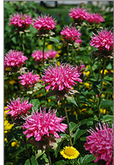
Marshall's Delight Beebalm flowers