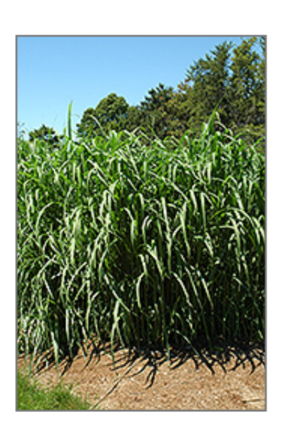
Giant Silver Grass