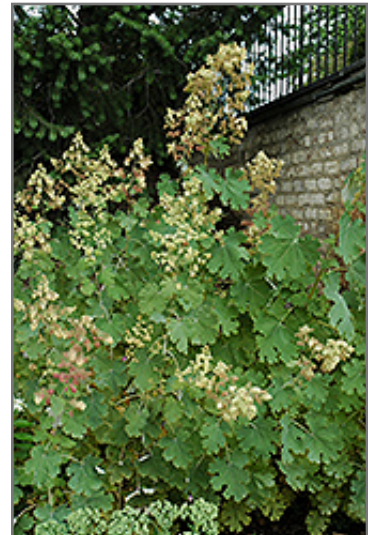
Plume Poppy in bloom