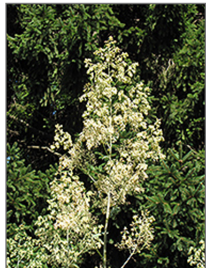
Plume Poppy flowers