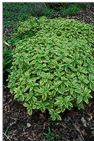
Golden Alexander Loosestrife