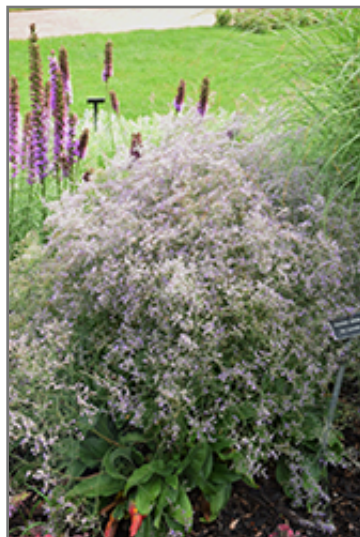
Sea Lavender in bloom