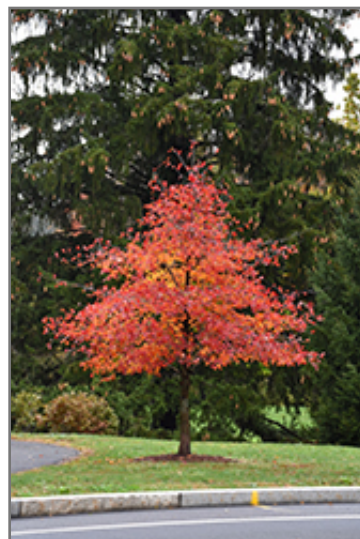
Black Gum in fall