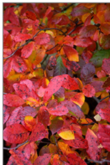
Black Gum in fall