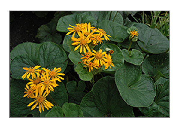
Desdemona Rayflower flowers

Desdemona Rayflower features bold panicles of gold daisy flowers at the ends of the stems from late summer to early fall. Its attractive large serrated round leaves emerge deep purple in spring, turning dark green in color with curious purple undersides and tinges of deep purple throughout the season.