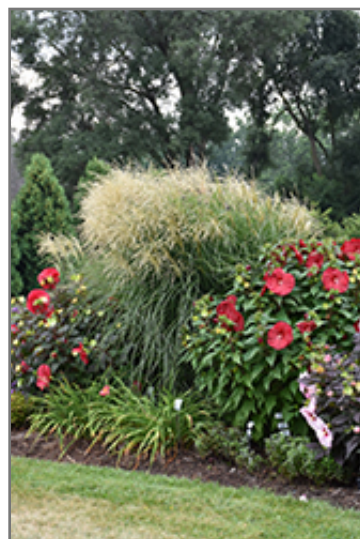
Encore Maiden Grass