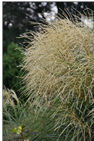
Encore Maiden Grass flowers

Encore Maiden Grass is recommended for the following landscape applications;