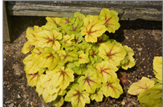
Catching Fire Foamy Bells

Catching Fire Foamy Bells is a dense herbaceous evergreen perennial with tall flower stalks held atop a low mound of foliage. Its medium texture blends into the garden, but can always be balanced by a couple of finer or coarser plants for an effective composition.