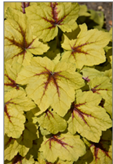
Catching Fire Foamy Bells foliage