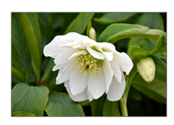
Wedding Party Wedding Bells Hellebore flowers

Wedding Party Wedding Bells Hellebore is recommended for the following landscape applications;