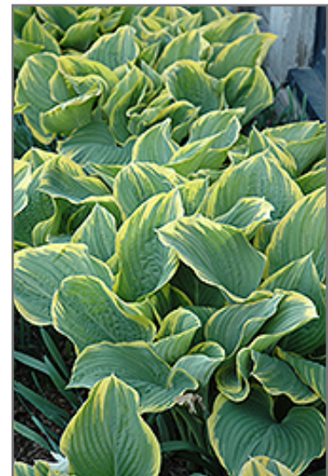
Sagae Hosta foliage