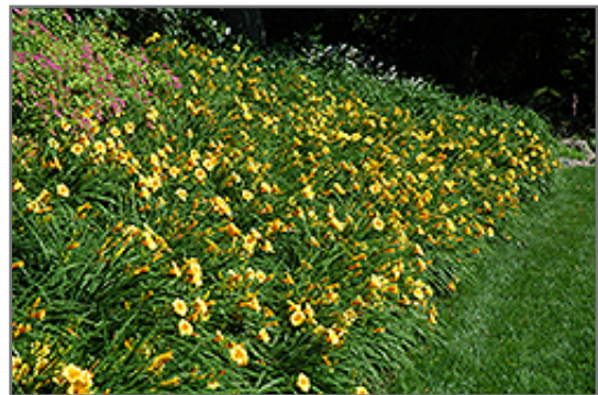
Happy Ever Appster Happy Returns Daylily in bloom