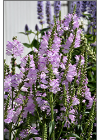
Pink Manners Obedient Plant flowers