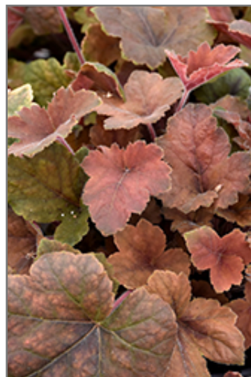
Pumpkin Spice Foamy Bells foliage

Pumpkin Spice Foamy Bells is recommended for the following landscape applications;