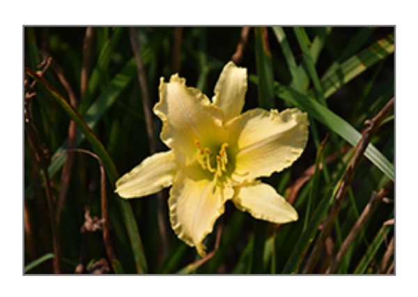
EveryDaylily Cream Daylily flowers