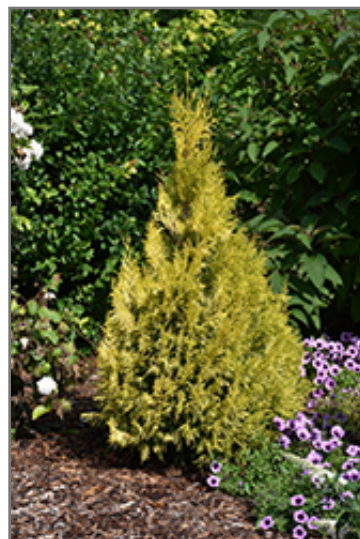
Filip's Magic Moment Arborvitae